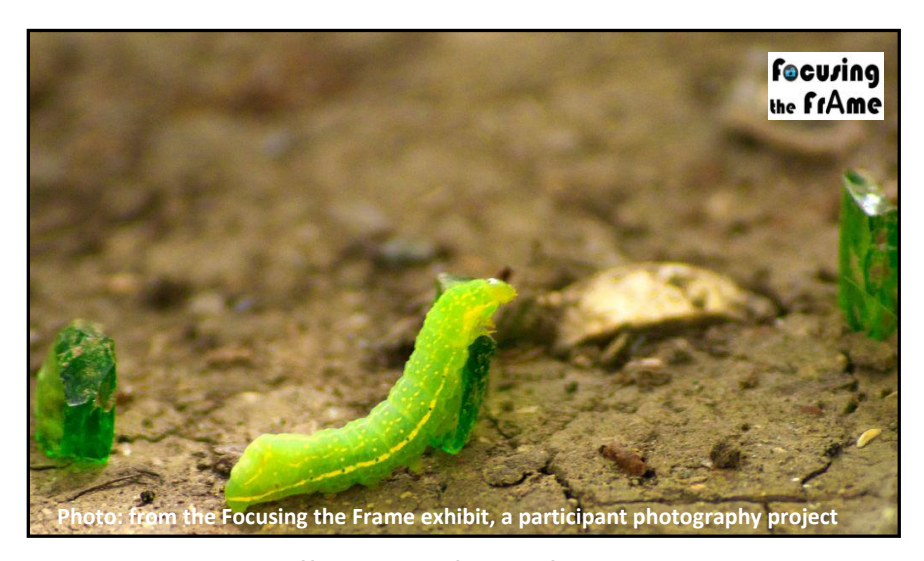
Caterpillars - Bridging the Gap

We hope that these early reports have given readers a sense of the scope and depth of the learning that has accrued over the course of this project as the many different players have tackled the daunting tasks associated with implementing it. The creativity and dedication behind the activities described in the early finding reports are typical of much of the work to date. Still, much of the knowledge that has been compiled cannot be captured in pictures, words and reports. It will always reside within the hearts and minds of those who have been involved. As we move forward we hope that the skills and wisdom that have developed will be an ongoing resource for those who want to improve the circumstances of those who are homeless and living with mental health issues.